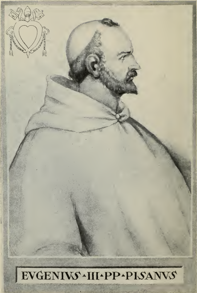
BLESSED EUGENIUS III (1145-53)